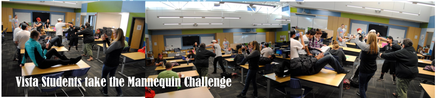
Vista Students take the Mannequin Challenge

Our website is up and running. Be sure to check us out at www.vistacharter.org and LIKE US on Facebook.